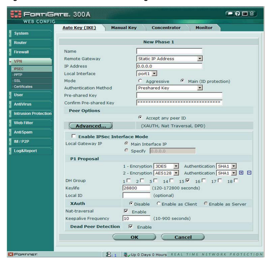
Figure 2: The FortiGate web-based manager