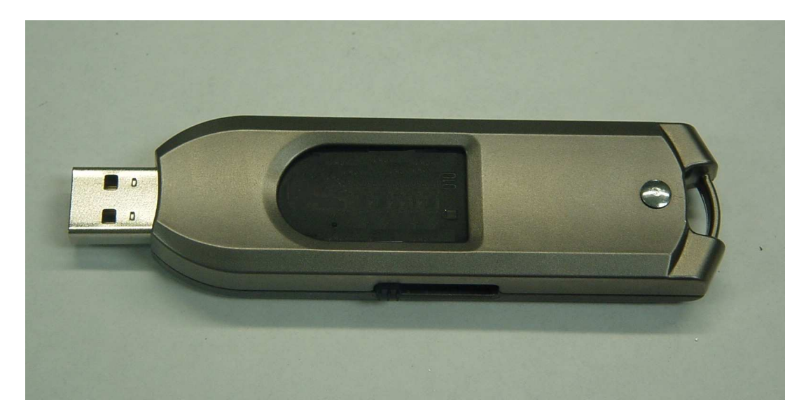
Figure 6: Photo of Stealth MXP Passport in Liquid Metal Case