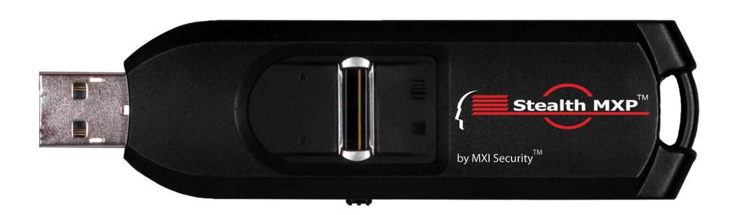
Figure 1: Photo of Stealth MXP in Plastic Case

The Stealth MXP Passport does not have a fingerprint sensor and thus does not provide biometric authentication so users authenticate to the device using a password. Except for the lack of Biometric operations, the Stealth MXP passport provides all the services of the Stealth MXP.