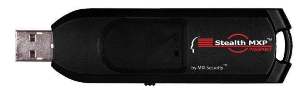
Figure 2: Photo of Stealth MXP Passport in Plastic Case