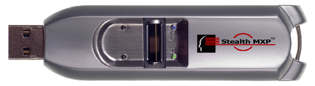
Figure 3: Photo of Stealth MXP in Metal Case