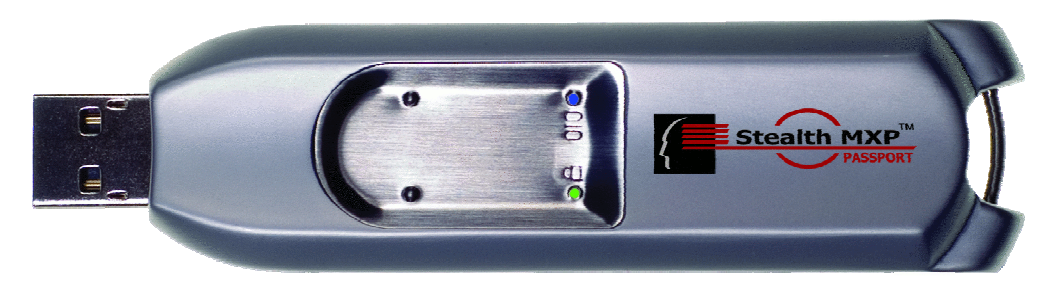
Figure 4: Photo of Stealth MXP Passport in Metal Case