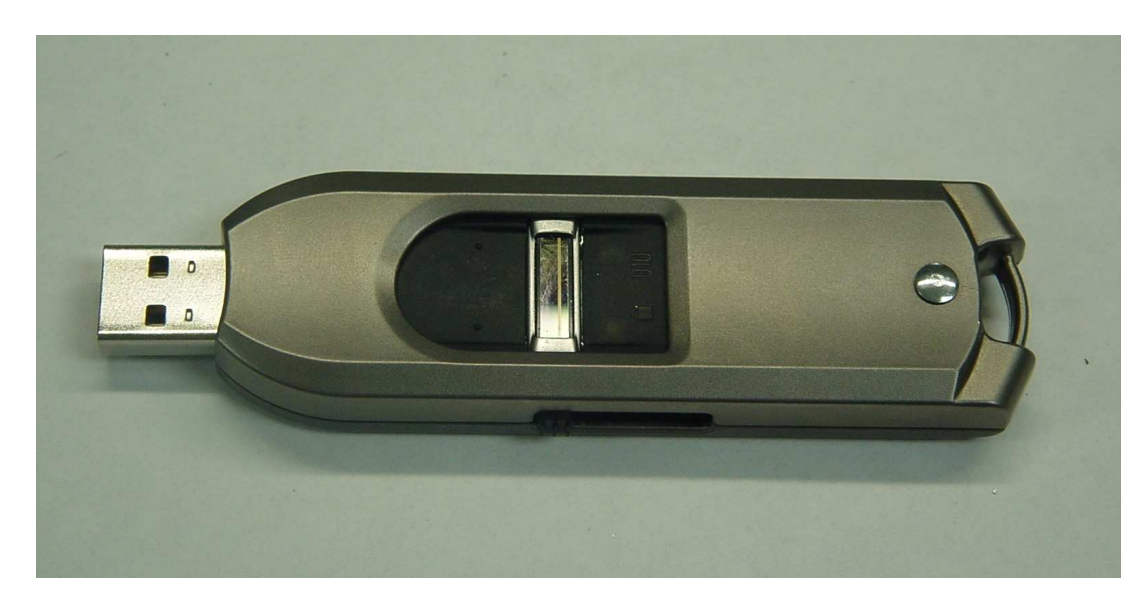
Figure 5: Photo of Stealth MXP in Liquid Metal Case