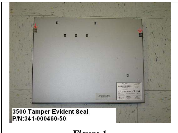
3500 Rear View

The chassis is sealed with two tamper-evident seals. The physical security of the module is intact if there is no evidence of tampering with the seals. The locations of the tamper-evident seals are indicated by the red arrows in Figure 1 below: