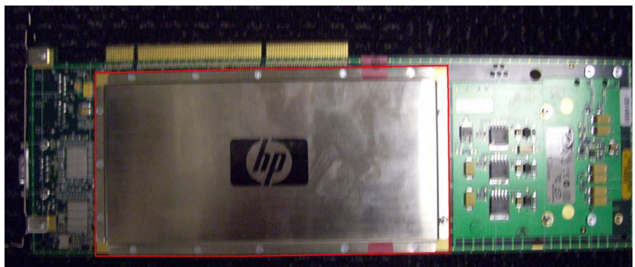
Figure 2: Back Side of Atalla Cryptographic Subsystem.