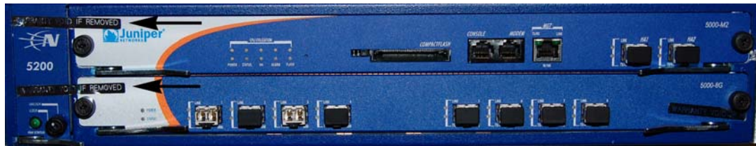
Fig. 2: Tamper Evident Mechanisms, Front of NetScreen-5200