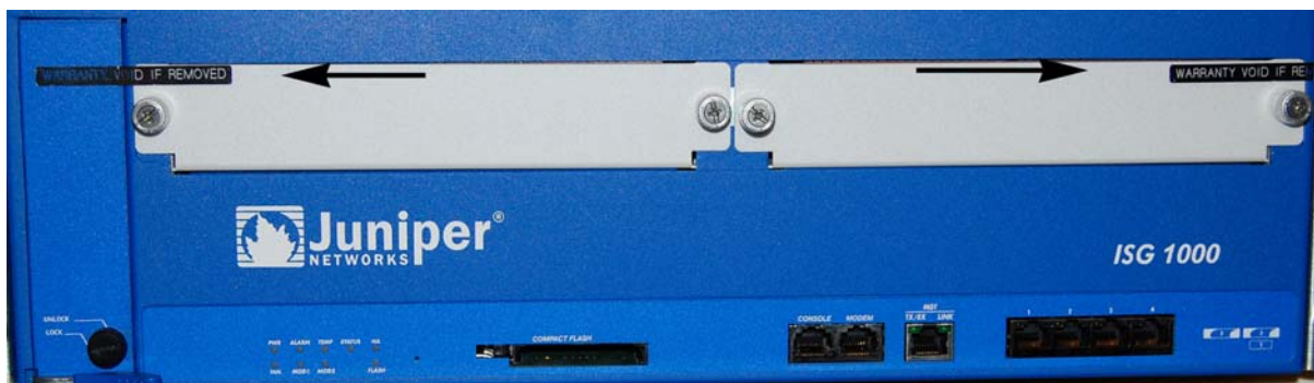
Fig. 1: Front of the ISG 1000, with location of tamper evident seals