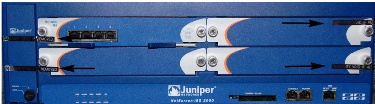
Fig. 3:Front of the ISG 2000, with location of tamper evident seals