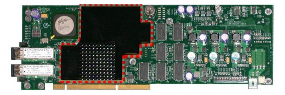
Figure 1: DCC primary side

Figure 1 and Figure 2 depict the primary and secondary sides of the DCC including the SEP cryptographic module. The SEP is the potted portion of the card included within the (superimposed) dotted red border. Note that the DCC contains other components that are outside of the cryptographic boundary.