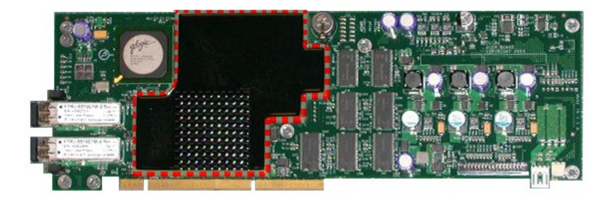
Figure 1: DCC (including SEP module) primary side

Figure 2 and Figure 1 depict the primary and secondary sides of the DCC including the SEP cryptographic module. The SEP is the potted portion of the card included within the (superimposed) dotted red border. Note that the DCC contains other components that are outside of the cryptographic boundary.