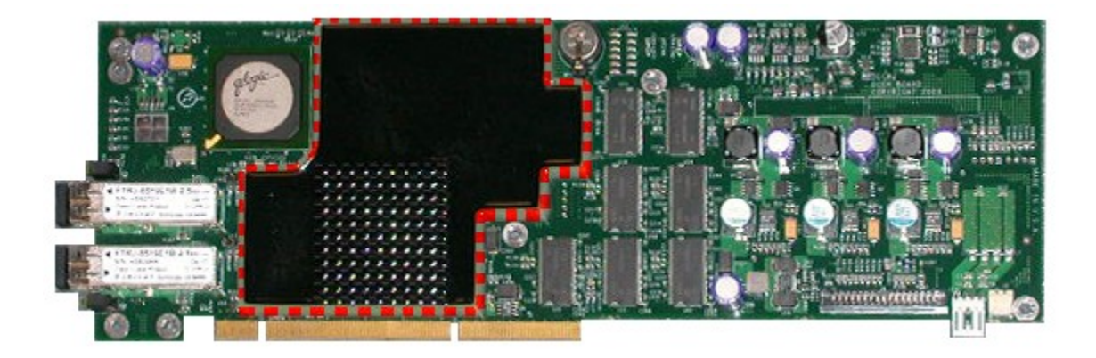
Figure 1: DCC (including SEP module) primary side

Figure 1 and Figure 2 depict the primary and secondary sides of the DCC including the SEP cryptographic module. The SEP is the potted portion of the card included within the (superimposed) dotted red border. Note that the DCC contains other components that are outside of the cryptographic boundary.