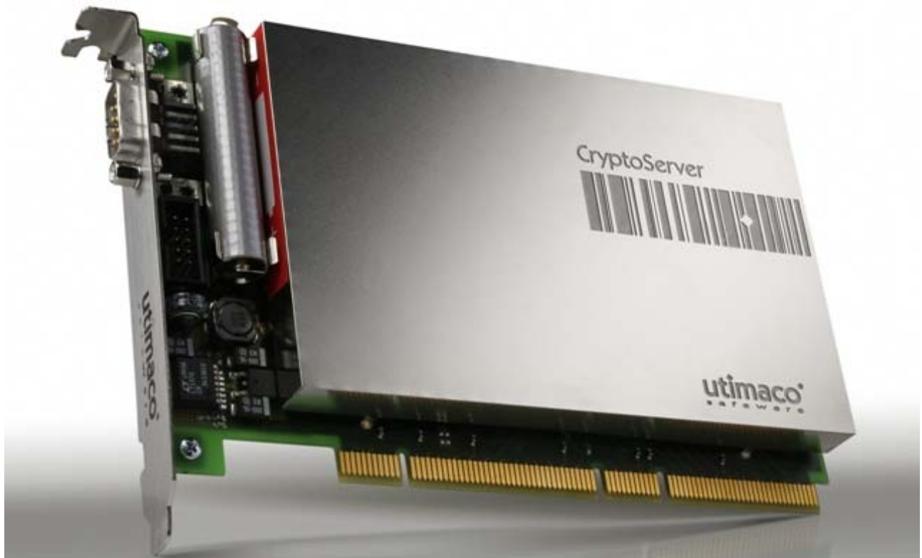
Figure 2 – CryptoServer CS mounted on the PCI carrier card