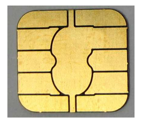
Figure 1 Crypto module

Included are a description of the security requirements for the cryptographic module and a qualitative description of how each security requirement is achieved. In particular, this security policy specifies the security rules under which the cryptographic module must operate.