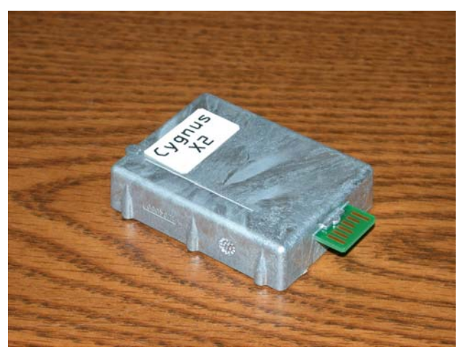
Figure 2 - Photograph of Physical Configuration