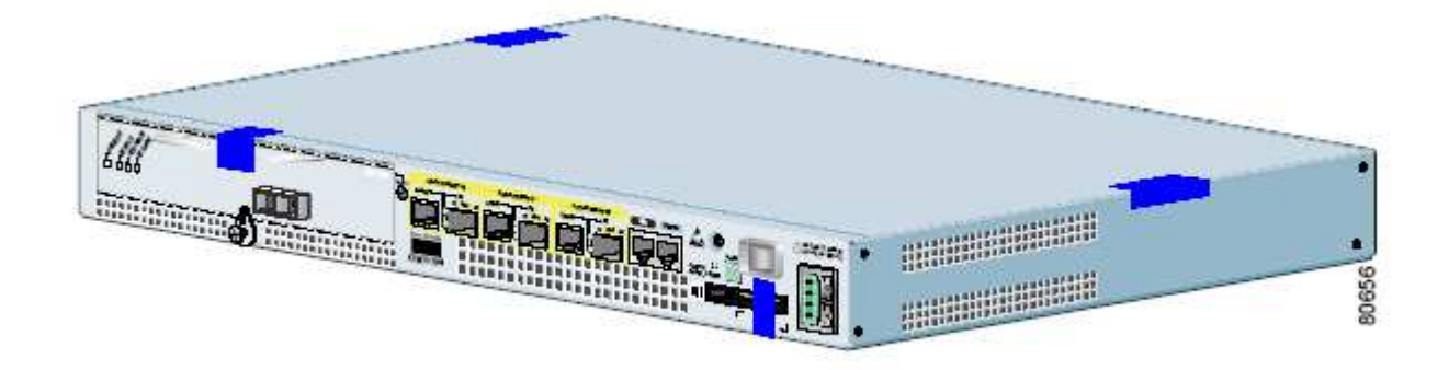
Figure 3 - 7301 (Front) Tamper Evident Label Placement

The tamper evident seals are produced from a special thin gauge vinyl with self-adhesive backing. Any attempt to open the device will damage the tamper evident seals or the material of the module cover. Since the tamper evident seals have non-repeated serial numbers, they may be inspected for damage and compared against the applied serial numbers to verify that the module has not been tampered with. Tamper evident seals can also be inspected for signs of tampering, which include the following: curled corners, rips, and slices.