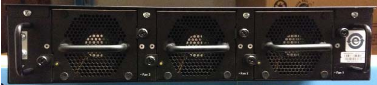
Figure 3 - Rear Panel of M-8000 P (No Ports)