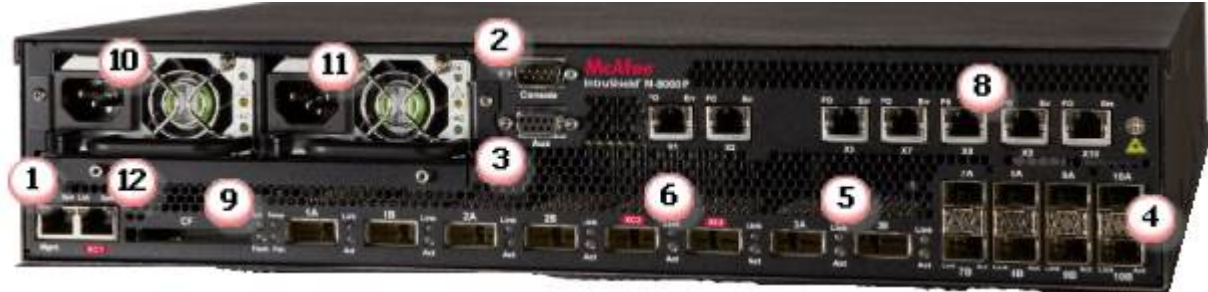
Figure 2 – M 8000 P Front Panel (with Power Supply Trays Populated)

Table 2 provides the cryptographic module’s ports and interfaces.