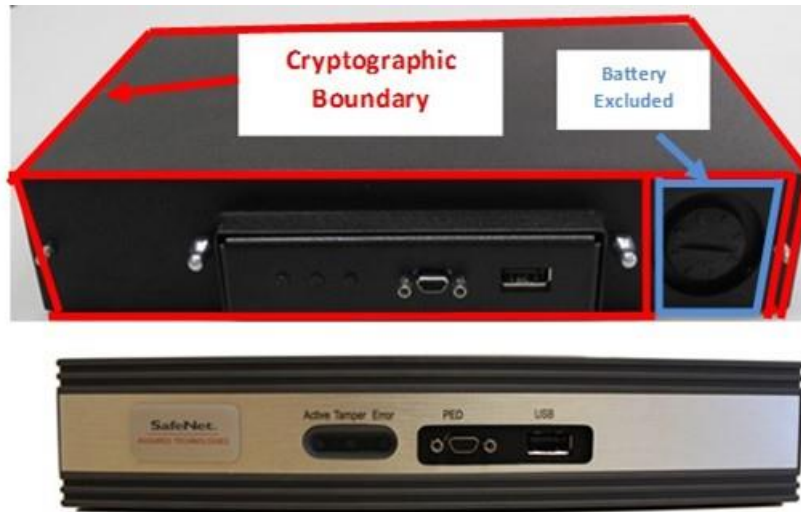
Figure 2-2. Luna G5 Cryptographic Boundary (with front bezel removed)