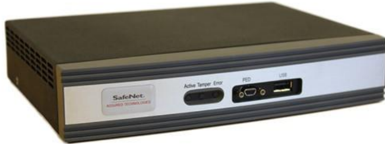
Figure 2-1. Luna G5 Cryptographic Module (with front bezel attached)