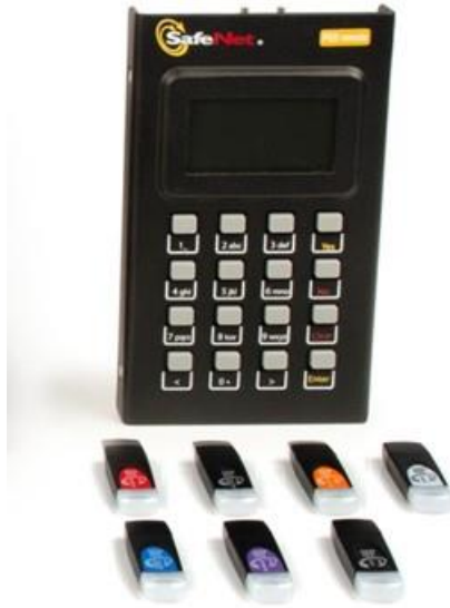
Figure 3-1. Luna PED and iKeys