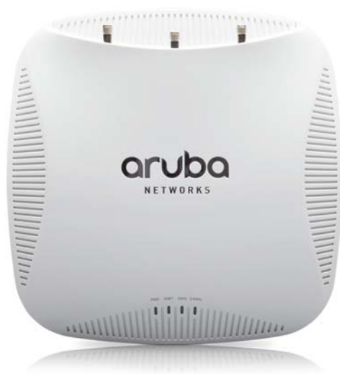
Figure 1 - Aruba AP-214

This section introduces the Aruba AP-214 Wireless Access Point (AP) with FIPS 140-2 Level 2 validation. It describes the purpose of the AP, its physical attributes, and its interfaces.