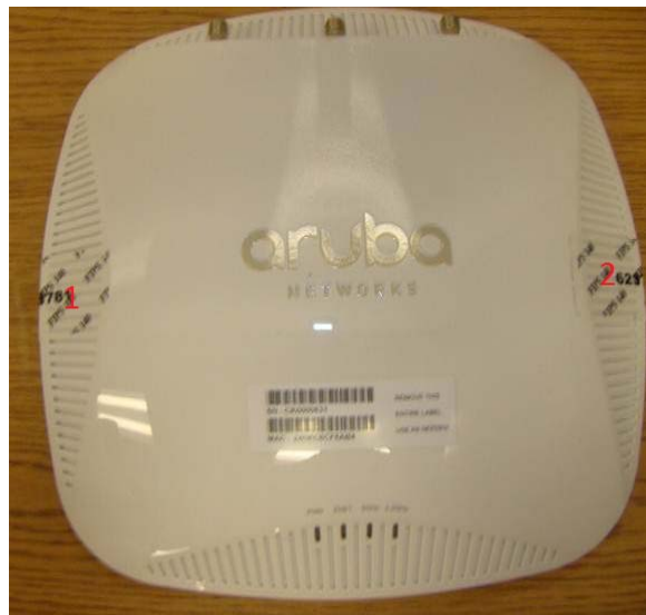
Figure 6 - Top View of AP-214 with TELs

The AP-214 requires 3 TELs. One on each edge (labels 1 and 2) and one covering the console port (label 3). See figures 6, and 7 for placement.