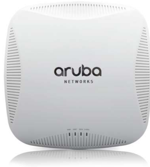
Figure 2 - Aruba AP-215

This section introduces the Aruba AP-215 Wireless Access Point (AP) with FIPS 140-2 Level 2 validation. It describes the purpose of the AP, its physical attributes, and its interfaces.