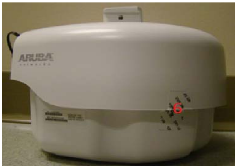
Figure 13 – Left Side View of AP-274 with TELs