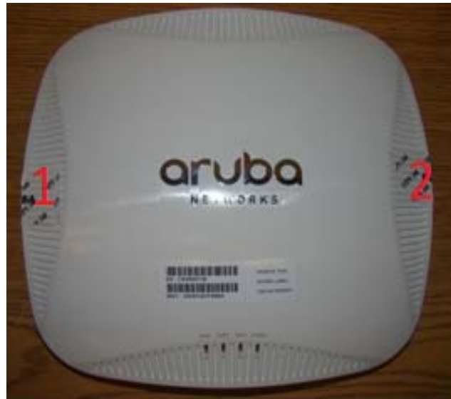
Figure 8 – Top View of AP-215 with TELs

The AP-215 requires 3 TELs. One on each edge (labels 1 and 2) and one covering the console port (label 3). See figures 8 and 9 for placement.