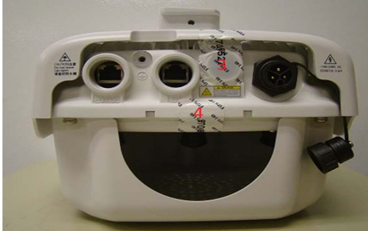
Figure 11 – Rear View of AP-274 with TELs