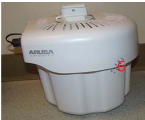
Figure 17 – Left Side View of AP-275 with TELs