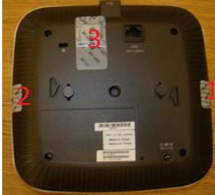
Figure 9 – Bottom View of AP-215 with TELs