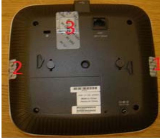
Figure 7 – Bottom View of AP-214 with TELs