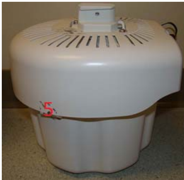
Figure 16 – Right Side View of AP-275 with TELs