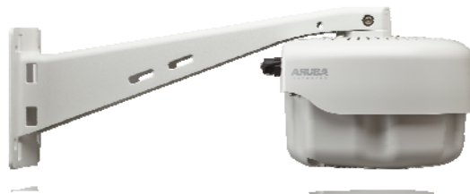
Figure 3 - Aruba AP-274

This section introduces the Aruba AP-274 Wireless Access Point (AP) with FIPS 140-2 Level 2 validation. It describes the purpose of the AP, its physical attributes, and its interfaces.