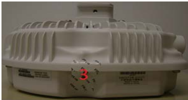
Figure 20 – Left Side View of AP-277 with TELs