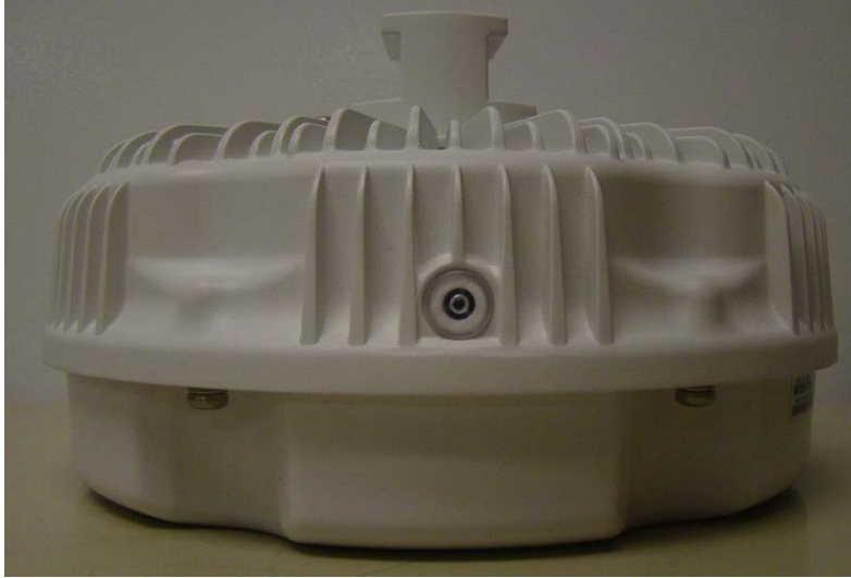
Figure 5 - Aruba AP-277

This section introduces the Aruba AP-277 Wireless Access Point (AP) with FIPS 140-2 Level 2 validation. It describes the purpose of the AP, its physical attributes, and its interfaces.