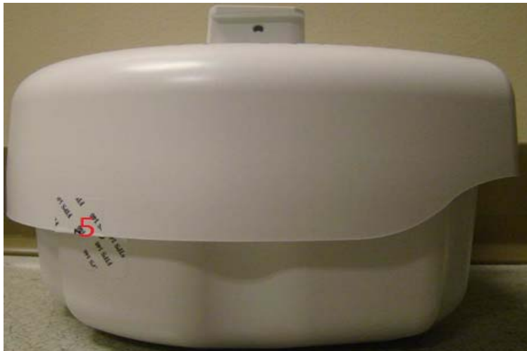
Figure 12 – Right Side View of AP-274 with TELs