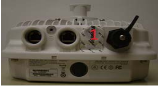
Figure 18 – Top View of AP-277 with TELs