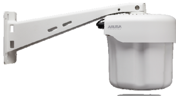
Figure 4 - Aruba AP-275

This section introduces the Aruba AP-275 Wireless Access Point (AP) with FIPS 140-2 Level 2 validation. It describes the purpose of the AP, its physical attributes, and its interfaces.