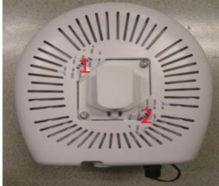
Figure 14 – Top View of AP-275 with TELs

The AP-275 requires a minimum of 6 TELs. Two sealing the top plate (labels 1 and 2), see Figure 14. One covering the console port (label 3) and one securing the body to the bottom (label 4), see Figure 15. Finally apply one label to each side sealing it to the bottom (labels 5 & 6), see figures 16 and 17 for placement.