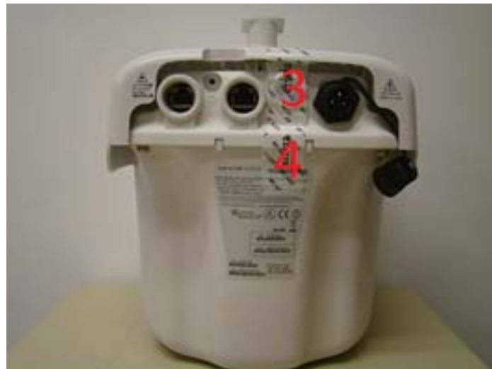
Figure 15 – Rear View of AP-275 with TELs