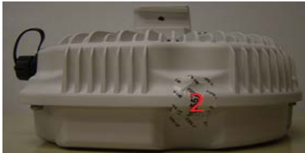
Figure 19 – Right Side View of AP-277 with TELs