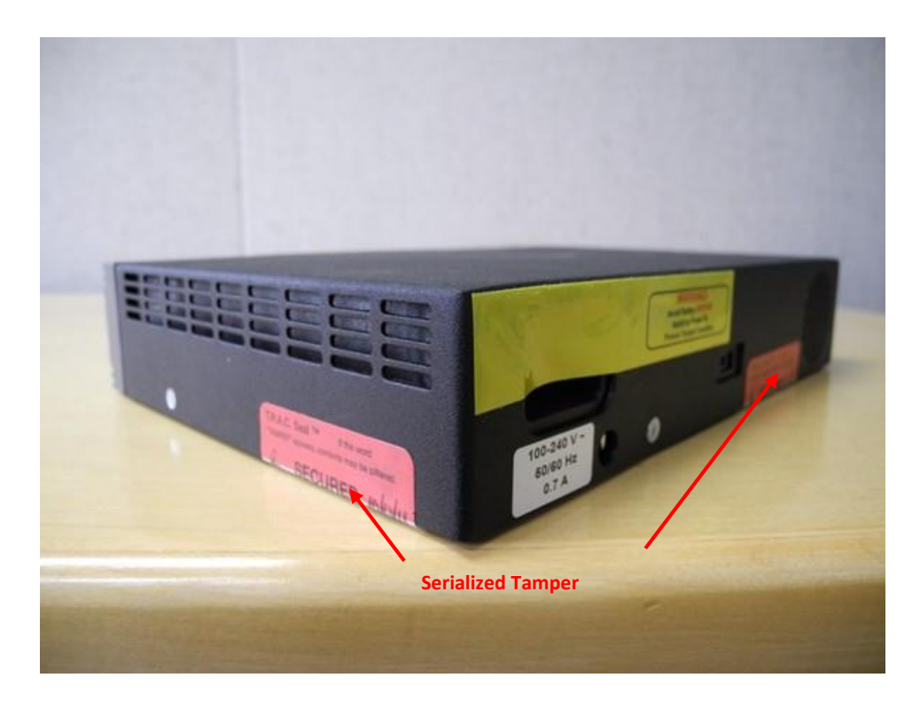
Figure 3-1. Use of Serialized Tamper Evident Labels on Luna G5