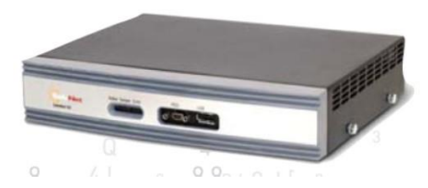
Figure 2-1. Luna G5 Cryptographic Module (with front bezel attached)