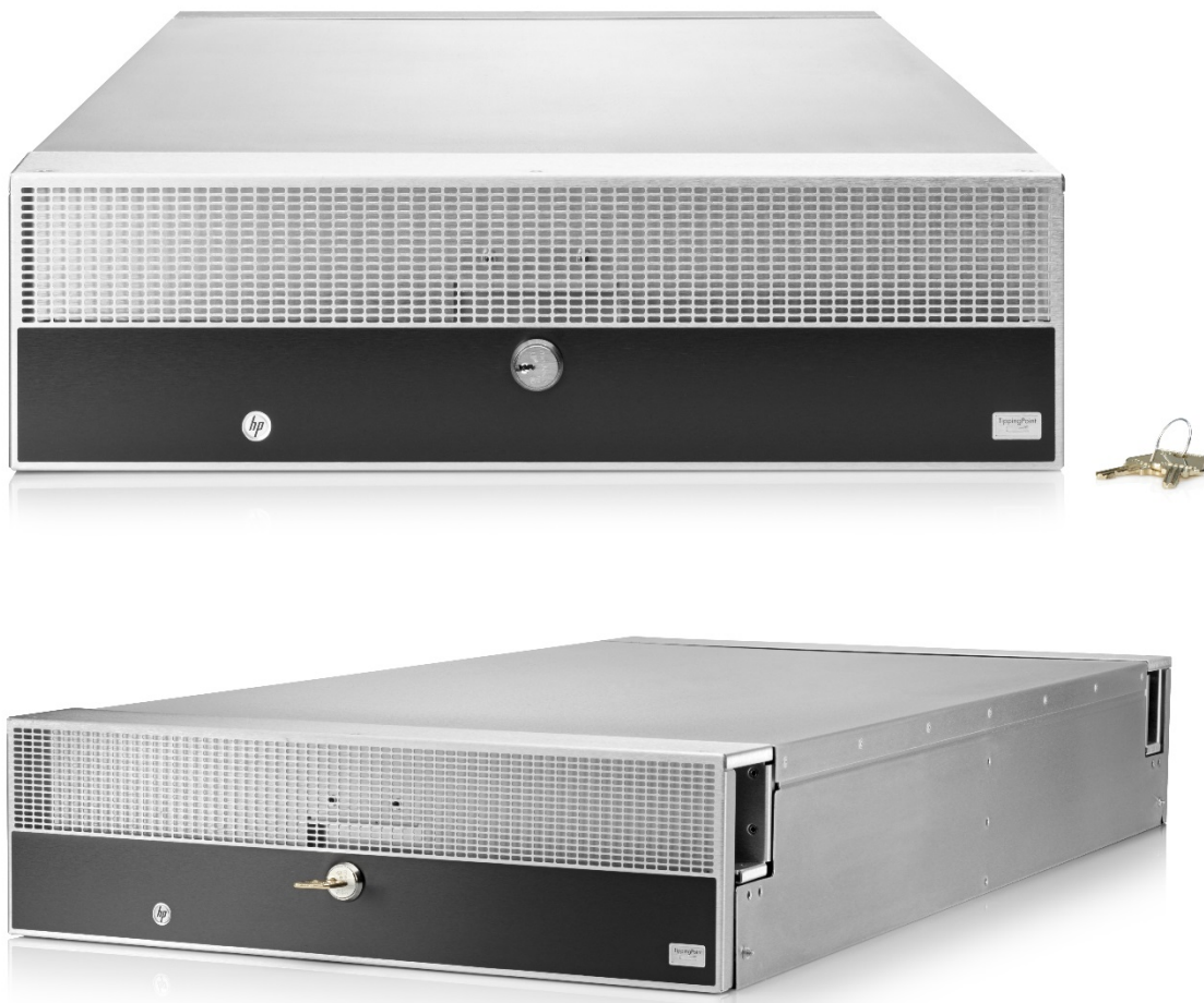
Figure 4: FIPS Box with covers locked in place

For ordering or replacing the FIPS Enclosure, contact a HEWLETT PACKARD ENTERPRISE sales representative to purchase Part # JC856A – HP FIPS Security Enclosure.