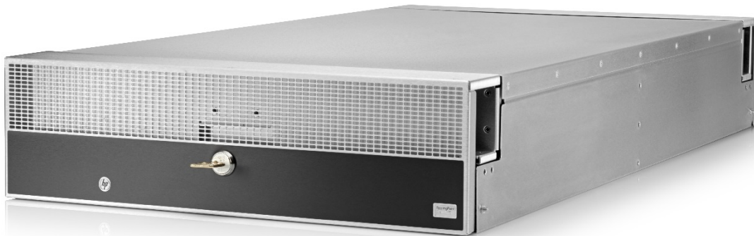
Figure 3: (top image) front view of FIPS enclosure. (bottom image) side view