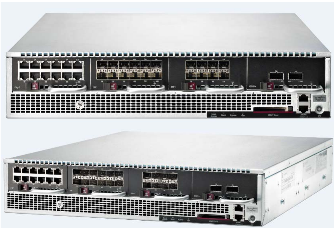
Figure 2: TippingPoint (Top 2 images) NX series front view and side view. All NX models are identical with the exception of the front label noting the model: 2600NX, 5200NX, 6200NX, 7100NX, 7500NX.