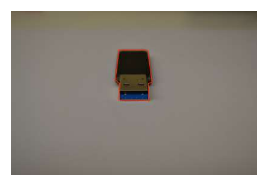
Figure 2 – Kanguru Defender 3000 (Front Side – Outlined in red)