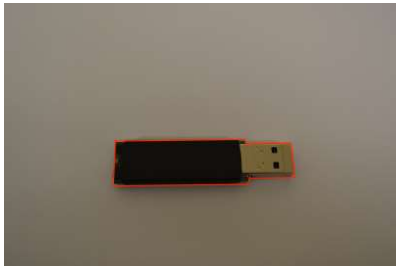
Figure 1 - Kanguru Defender 3000 (Top Side - Outlined in red)