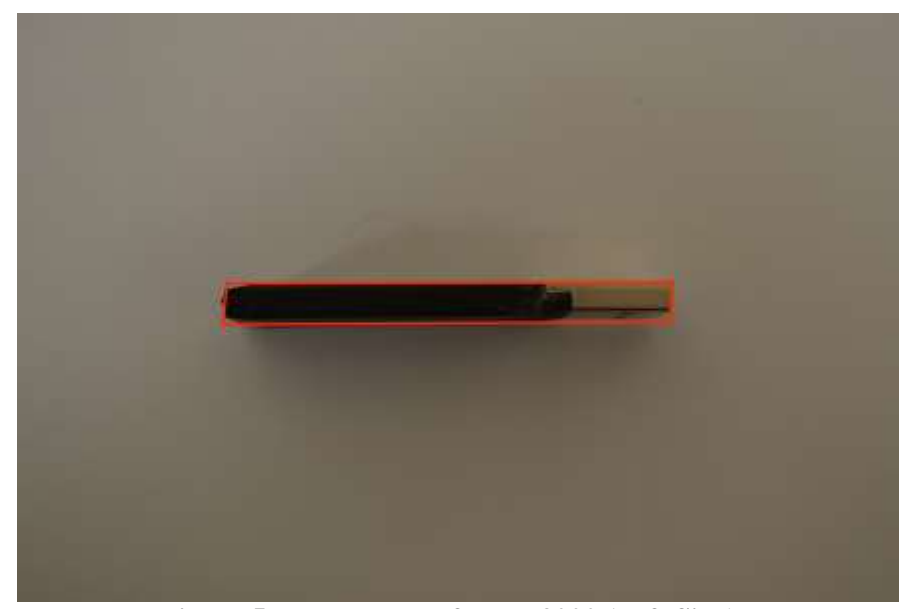
Figure 5 – Kanguru Defender 3000 (Left Side)