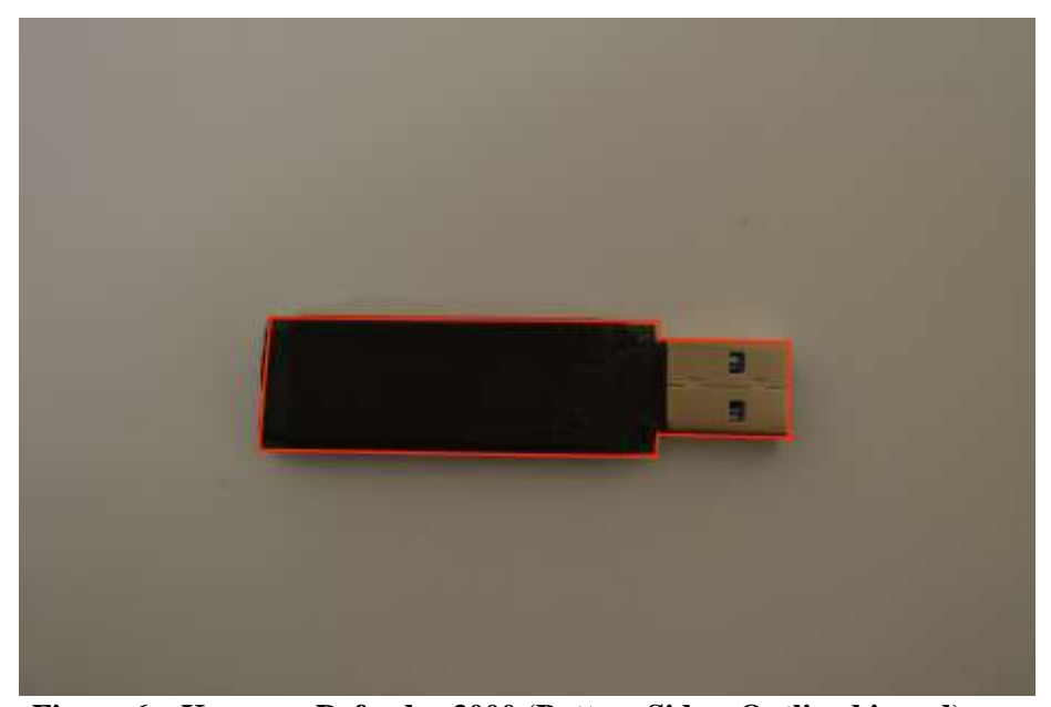
Figure 6 – Kanguru Defender 3000 (Bottom Side – Outlined in red)