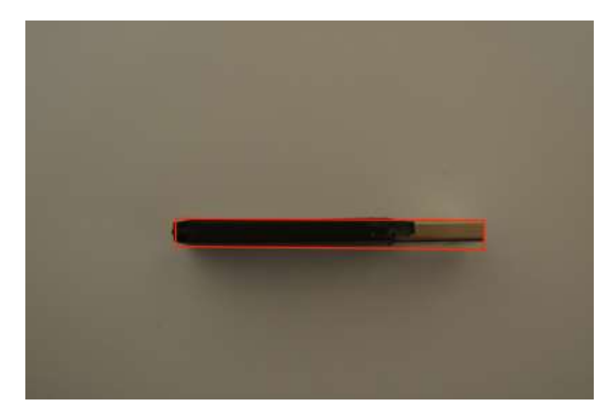
Figure 3 – Kanguru Defender 3000 (Right Side – Outlined in red)