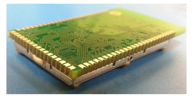
Figure 1 – Module Physical Boundary (bottom side, identical for both PNs)

The Module's physical form is depicted in the images below: