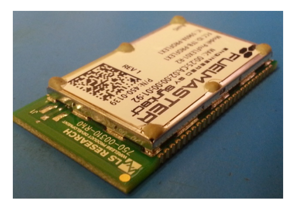
Figure 2 – Module Physical Boundary (top side, PN: 450-0139)