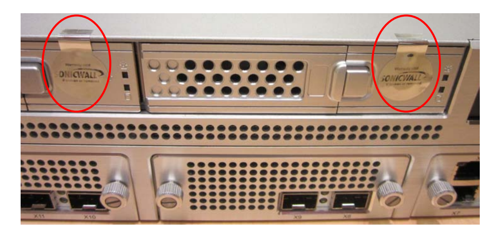
Figure 5 – Front Tamper Seals (qty. 2)