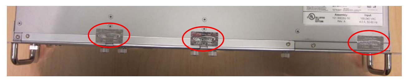
Figure 3 - Underside Tamper Seals (qty. 3) (also protect front expansion bays)