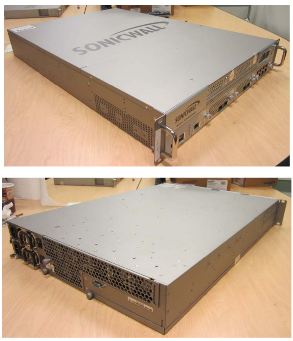
Figure 1 – Images of the Cryptographic Module

The SonicWALL SRA EX9000 (HW P/N 101-500352-50 Rev A, FW Version SRA 10.6.1) is a multi-chip standalone cryptographic module enclosed in a hard, opaque, commercial grade metal case. The primary purpose of the module is to provide secure remote access to internal resources via the Internet Protocol (IP). The module provides network interfaces for data input and output.