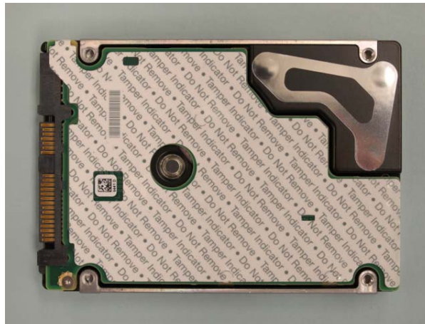
Figure 1: Savvio® 10K.6 (SAS Interface)