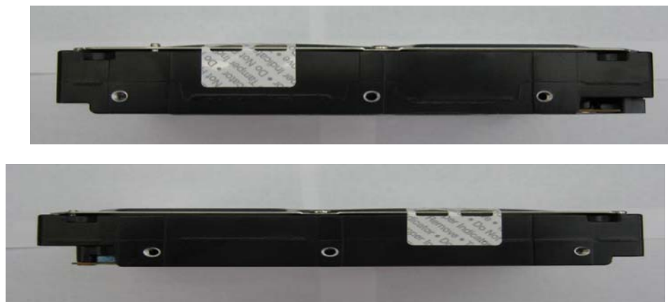
Figure 5: Constellation® ES.3 (SAS/SATA Interface) security labels on sides of drive