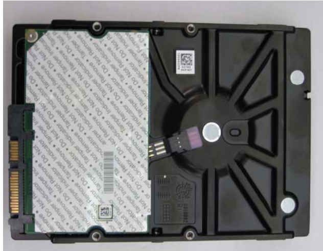
Figure 3: Constellation® ES.3 (SATA Interface)