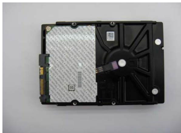
Figure 2: Constellation® ES.3 (SAS Interface)