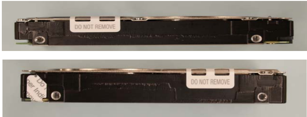
Figure 4: Savvio® 10K.6 (SAS Interface) security labels on sides of drive