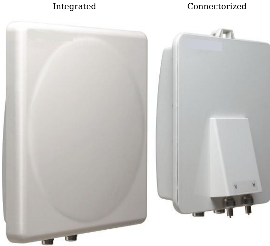
Figure 1 - PTP 600 Wireless Units