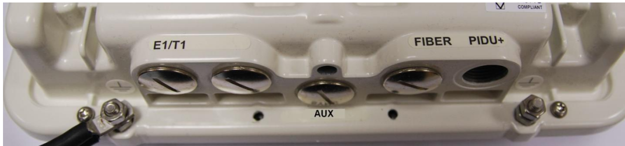
Figure 3 – Port identification