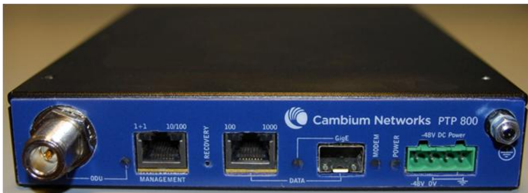
Figure 1 - PTP 800 CMU

The purpose of this security policy is to validate the Cambium PTP 800 Series software Version PTP 800-04-12 submitted for FIPS 140-2 Level 1 validation.