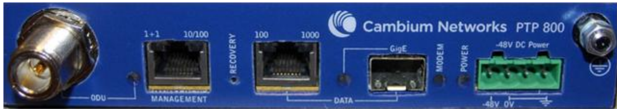
Figure 2 – PTP 800 CMU Front Panel

Image showing PTP 800 CMU port identification /annotations: