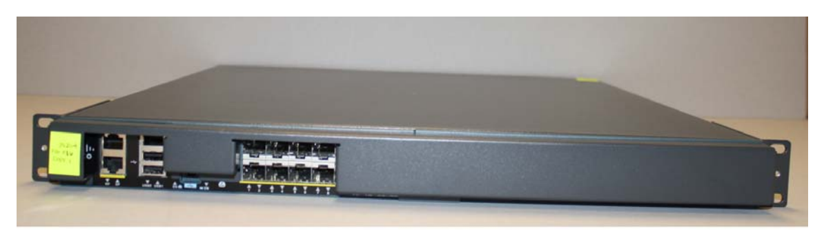
Figure 1 Entire Module

The module automatically detects, authorizes and configures access points, setting them up to comply with the centralized security policies of the wireless LAN. In a wireless network operating in this mode, WPA2 protects all wireless communications between the wireless client and other trusted networked devices on the wired network with AES-CCMP encryption. CAPWAP protects all control and bridging traffic between trusted network access points and the module with DTLS encryption.