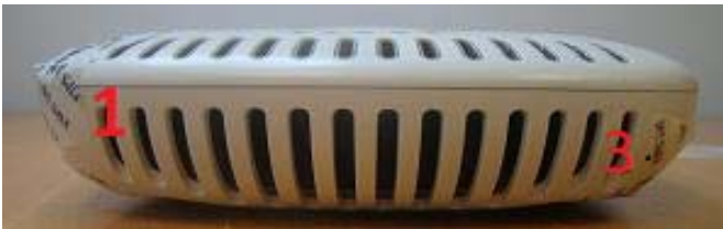
Figure 1: AP-134 Front view

Following is the TEL placement for the AP-134: