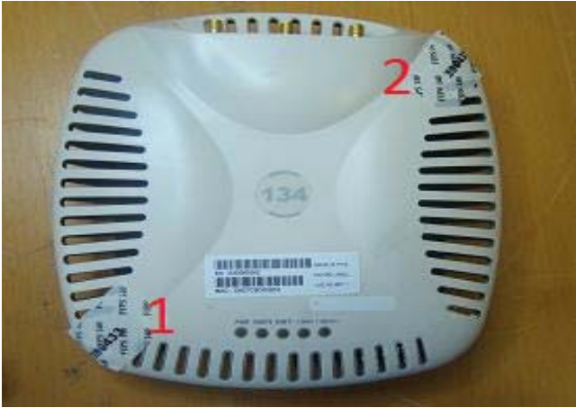
Figure 4: AP-134 Top View