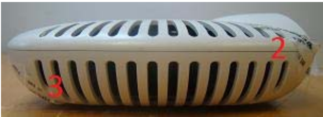
Figure 5: AP-134 Right View