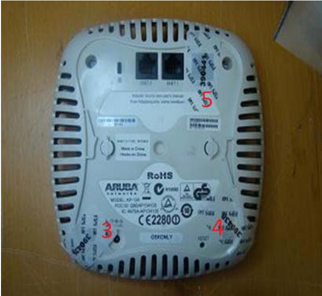
Figure 6: AP-134 Bottom View