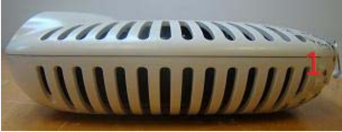
Figure 3: AP-134 Left View