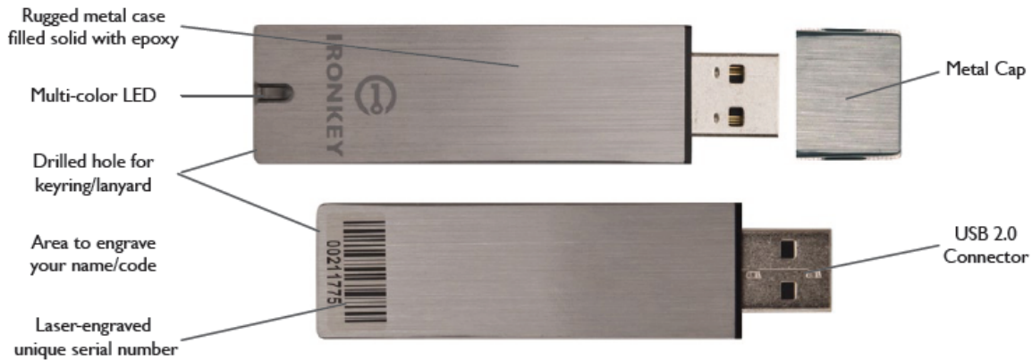
Figure 1 – Image of the Cryptographic Module (S250)

The cryptographic boundary is defined as being the outer perimeter of the metallic enclosure and is depicted below.