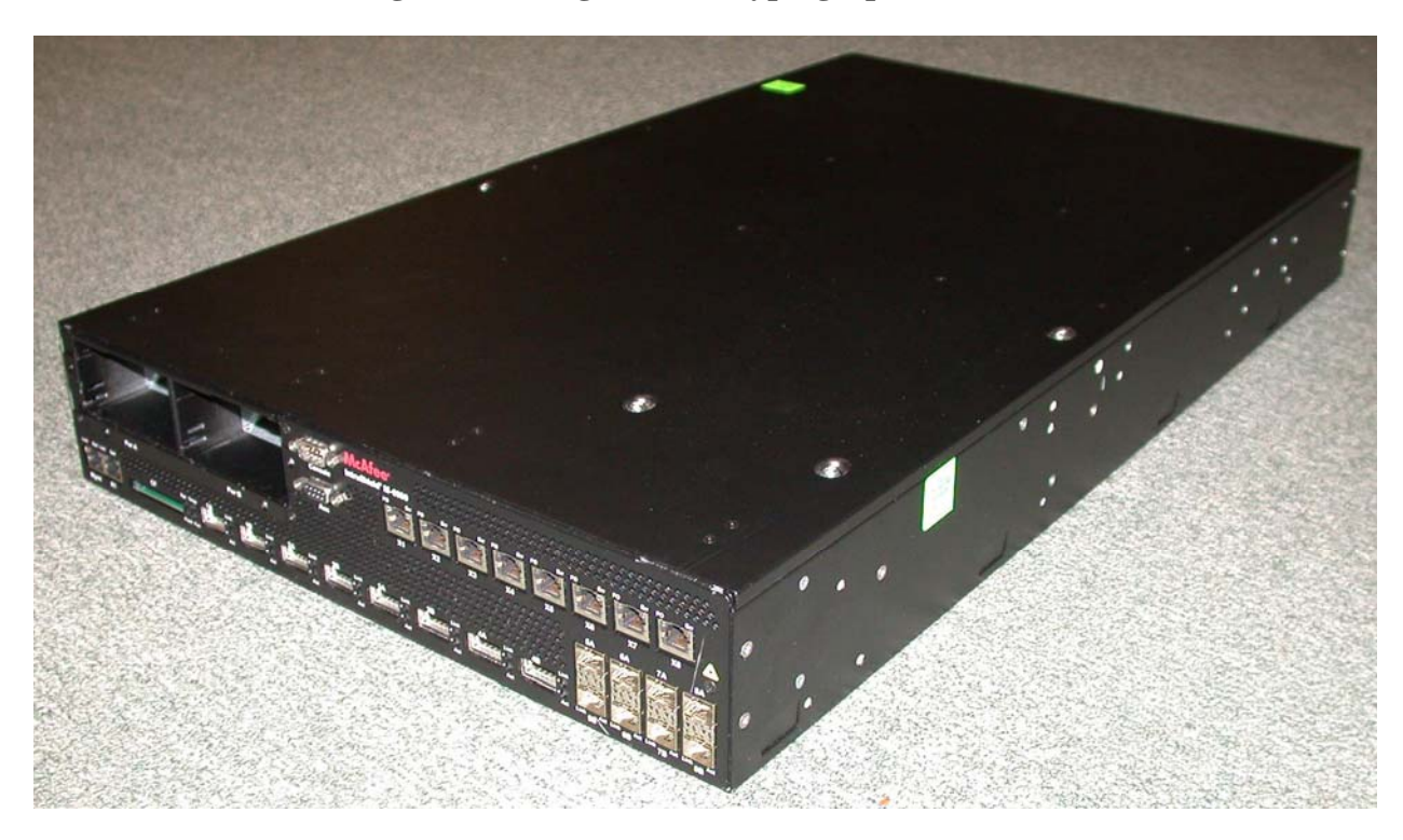
Figure 1 – Image of the Cryptographic Module

Figure 1 shows the module and its cryptographic boundary.