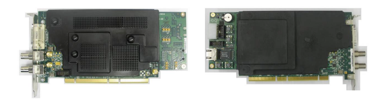
Figure 2: Hardware Model DOLPHIN-DCI-1.2-C0