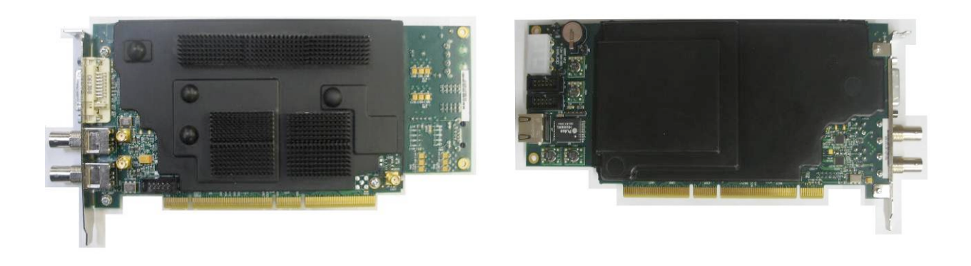
Figure 1: Hardware Model DOLPHIN-DCI-1.2-A0

The pictures below present the four Dolphin DCI 1.2 hardware models: