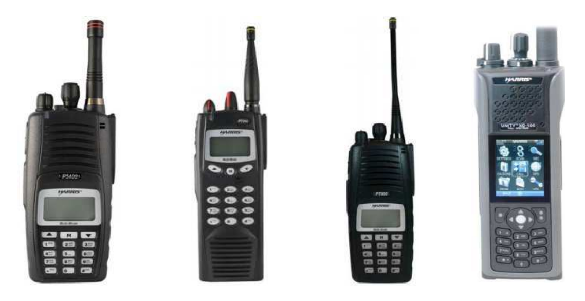
Figure I - HALM Portable Terminals (Right to left: 5400, 7200, 7300, and Unity)

Harris is a leading supplier of systems and equipment for public safety, federal, utility, commercial, and transportation markets. Their products range from the most advanced IP¹ voice and data networks, to industry-leading multiband/multimode radios, and even public safety-grade broadband video and data solutions. Their comprehensive line of software–defined radio products and systems support the critical missions of countless public and private agencies, federal and state agencies, and government, defense, and peacekeeping organizations throughout the world. This Security Policy documents the security features of the Harris AES Software Load Module (HALM) incorporated into the Harris 5300 (Mobile 800Mhz only), 5400 (Portable only), 5500 (Portable only), 7200, 7300, Unity, XG-75 UHF-L, XG-75 VHF XG-75 (800 MHz) and other terminal products, which are single and multi–band multi–mode radios that deliver end–to–end encrypted digital voice and data communications, and are Project 25 Phase 2 upgradable². The HALM is identified as part SK-015086-001 R03A06.