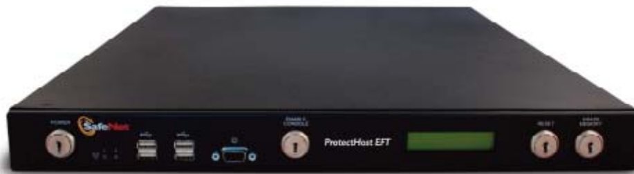
Figure 2.1.1. SafeNet Luna EFT

The loader firmware is implemented as a 32-bit protected mode Intel executable and runs as the only application on a specially cut-down Fedora Core 3 (FC3) Operating System (O/S). The FC3 system launches the loader firmware and provides disk and memory management services and communication services to the loader firmware.