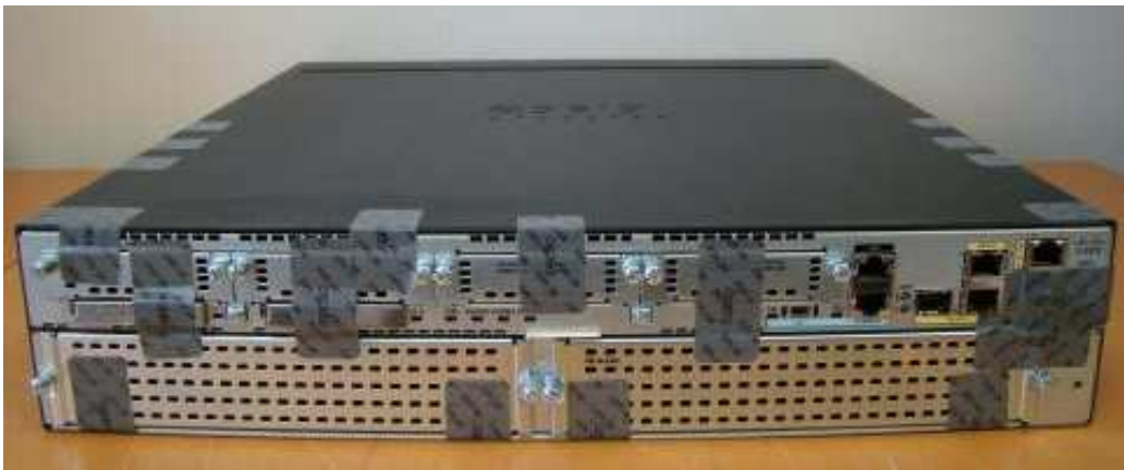
Figure 2: Cisco 2951 ISR Back