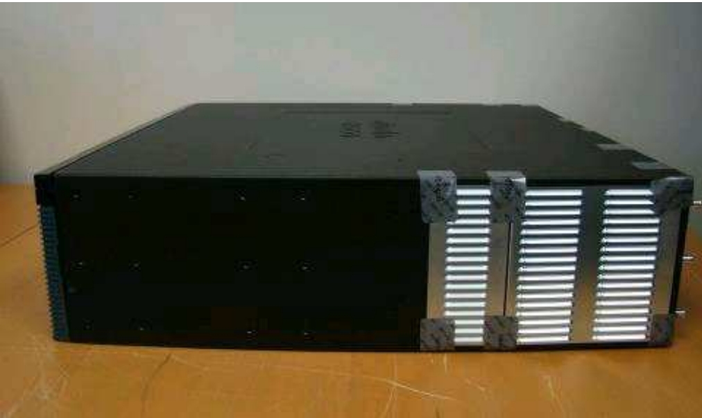
Figure 11: Cisco 3925 ISR Right Side