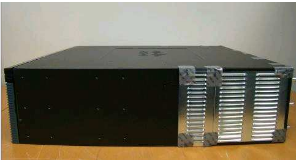
Figure 17: Cisco 3945 ISR Right Side