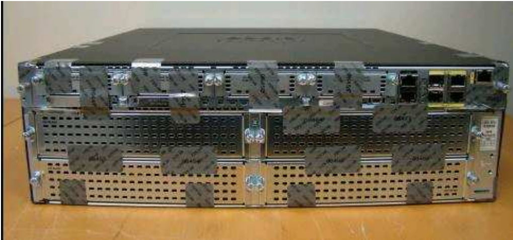
Figure 14: Cisco 3945 ISR Back