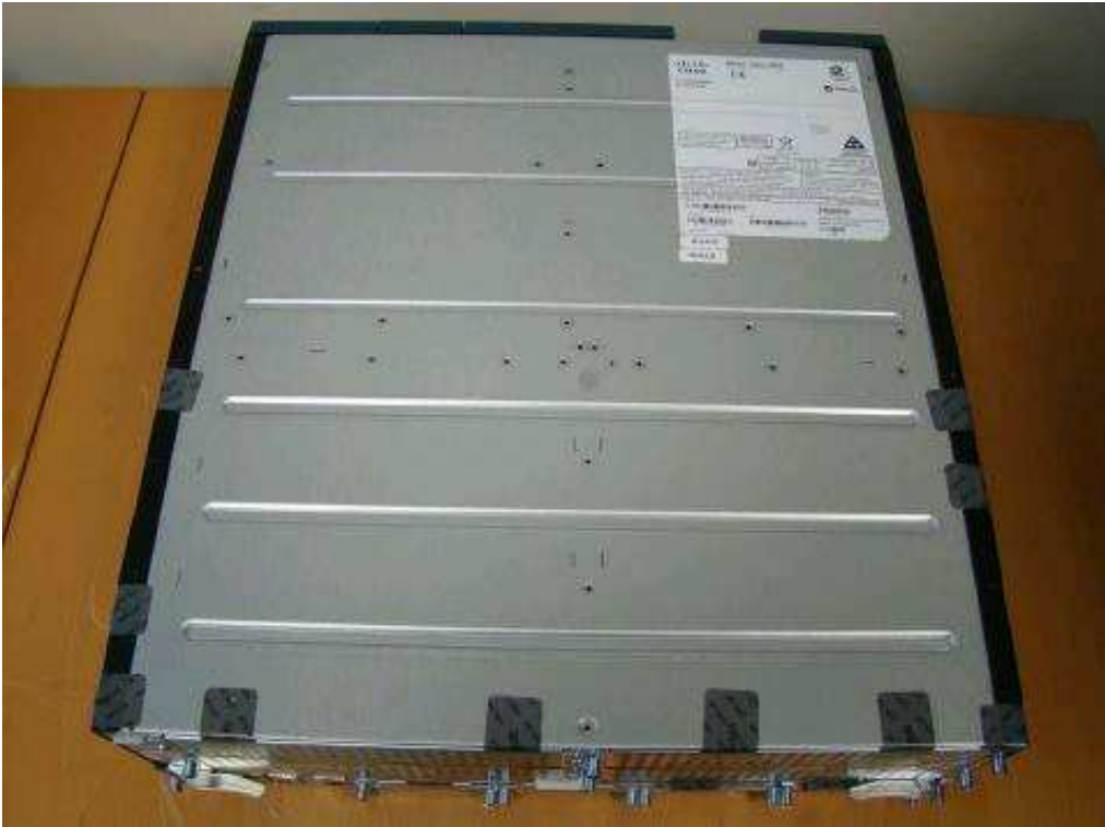
Figure 10: Cisco 3925 ISR Bottom