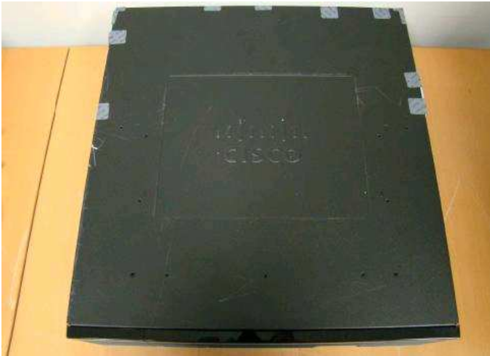
Figure 15: Cisco 3945 ISR Top