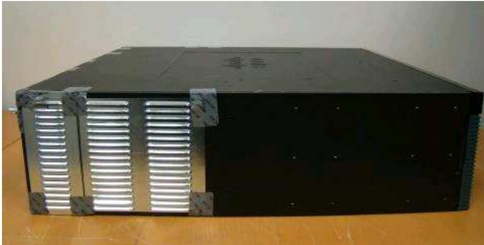
Figure 18: Cisco 3945 ISR Left Side