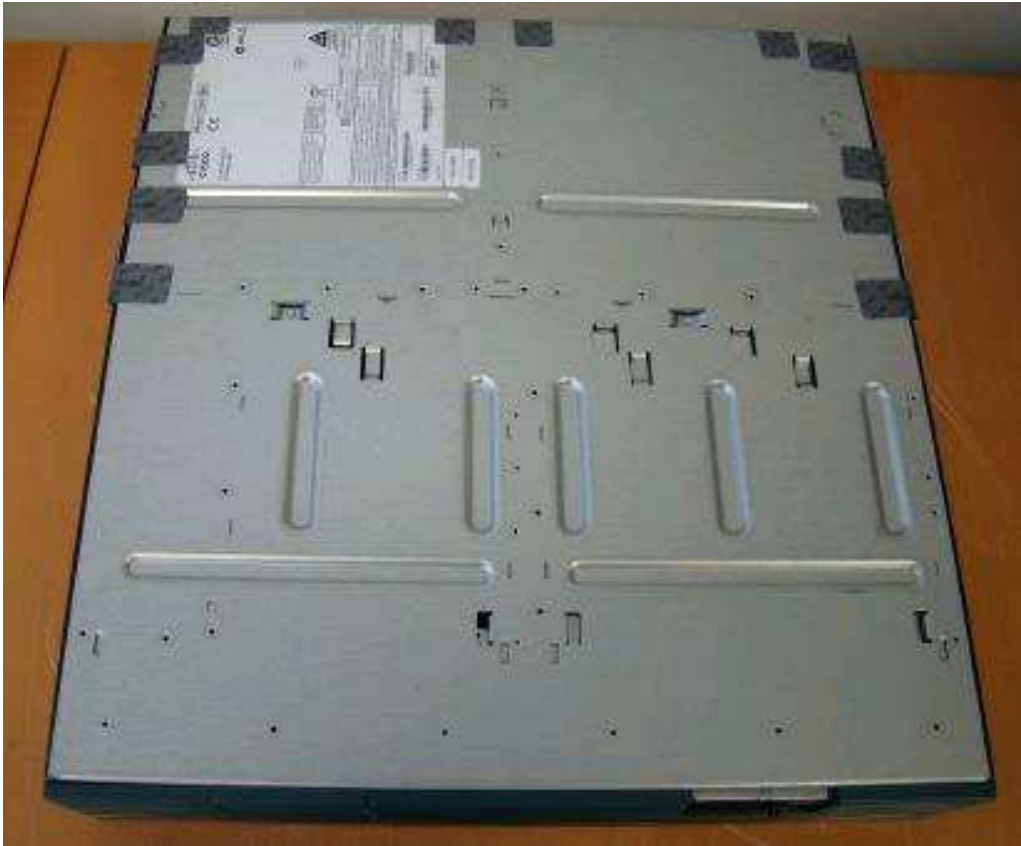
Figure 4: Cisco 2951 ISR Bottom