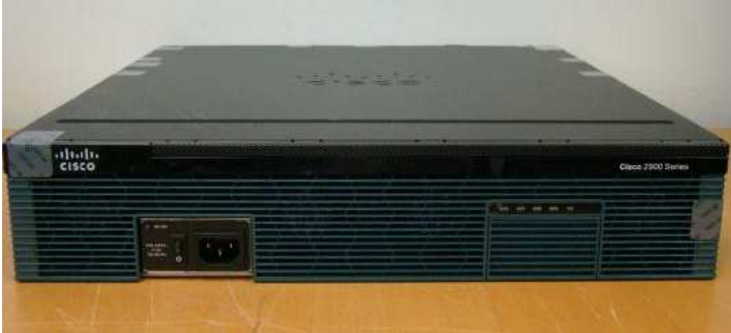
Figure 1: Cisco 2951 ISR Front

Install the opacity plates and apply serialized tamper-evidence labels as specified in the pictures below: