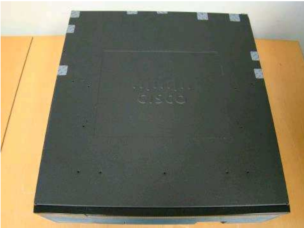
Figure 9: Cisco 3925 ISR Top