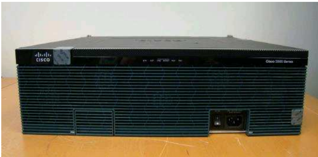
Figure 13: Cisco 3945 ISR Front