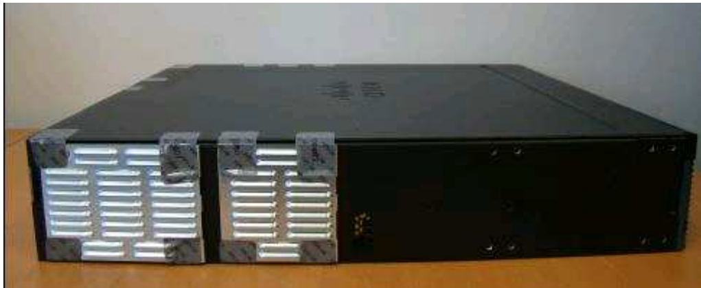
Figure 5: Cisco 2951 ISR Right Side