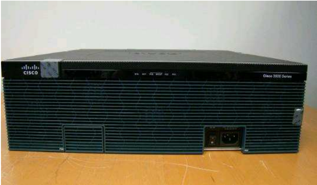
Figure 7: Cisco 3925 ISR Front