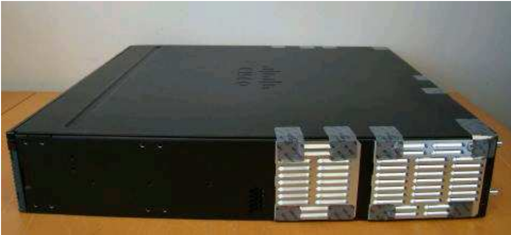
Figure 6: Cisco 2951 ISR Left Side