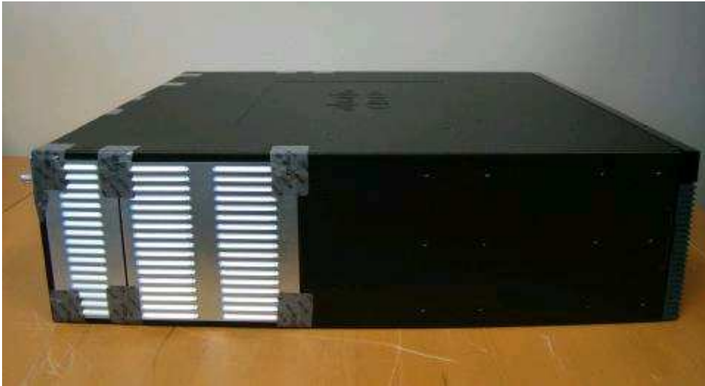
Figure 12: Cisco 3925 ISR Left Side