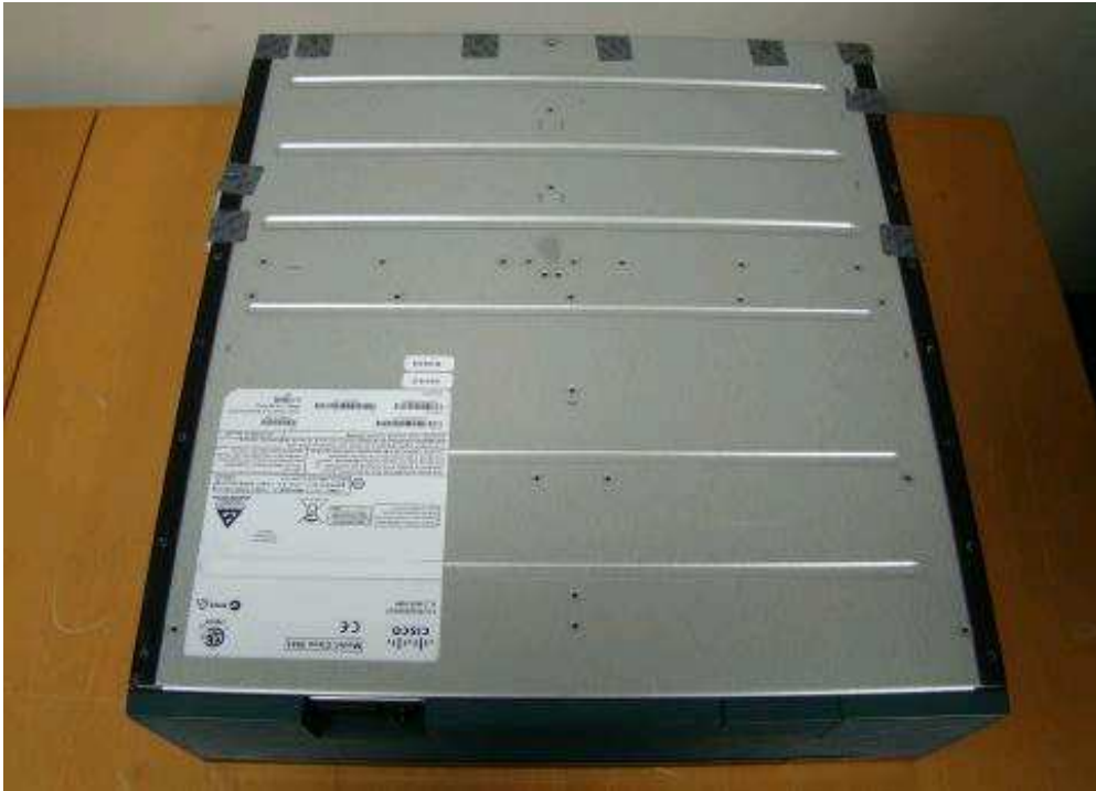
Figure 16: Cisco 3945 ISR Bottom