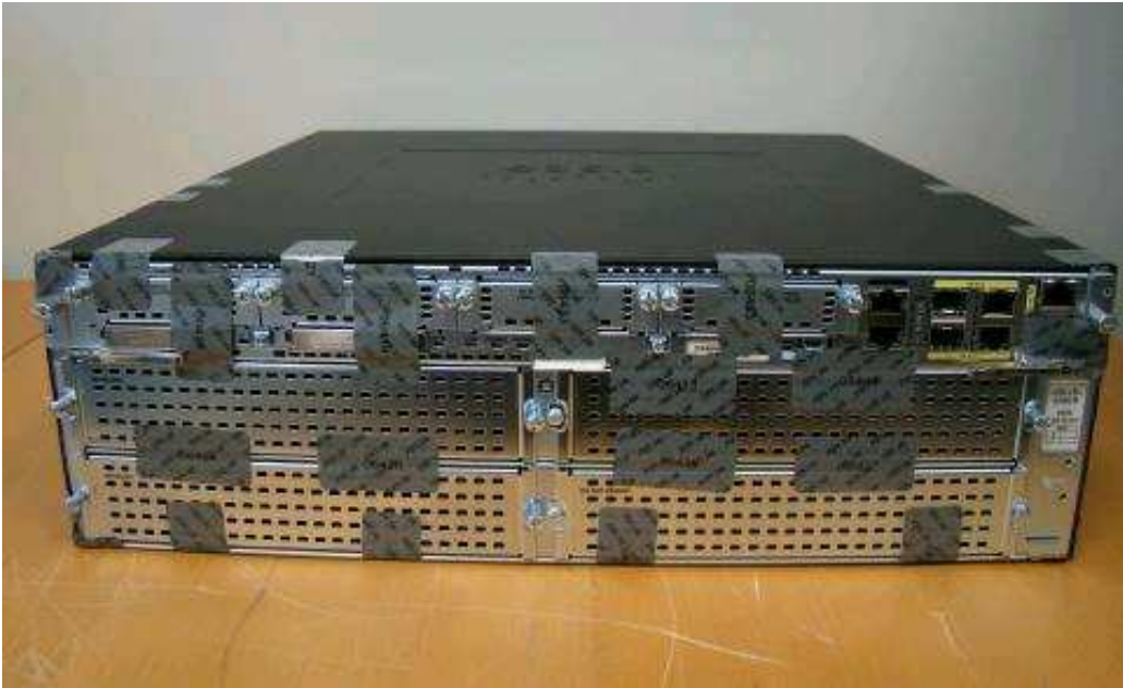
Figure 8: Cisco 3925 ISR Back