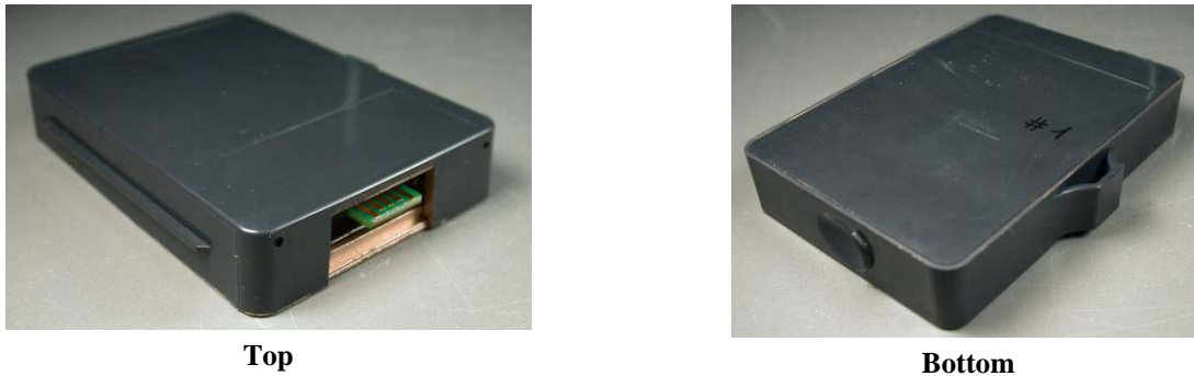
Figure 1 Postal Security Device module (PSD)

The PSD (Figure 1) consists of a cryptographic sub function and postal services sub function sharing common hardware that is contained on a printed circuit board and enclosed within a hard, opaque, plastic enclosure encapsulating the epoxy potted module which is wrapped in a special tamper detection envelope with a response mechanism that causes the zeroization of plaintext CSPs. This enclosure constitutes the cryptographic physical boundary.