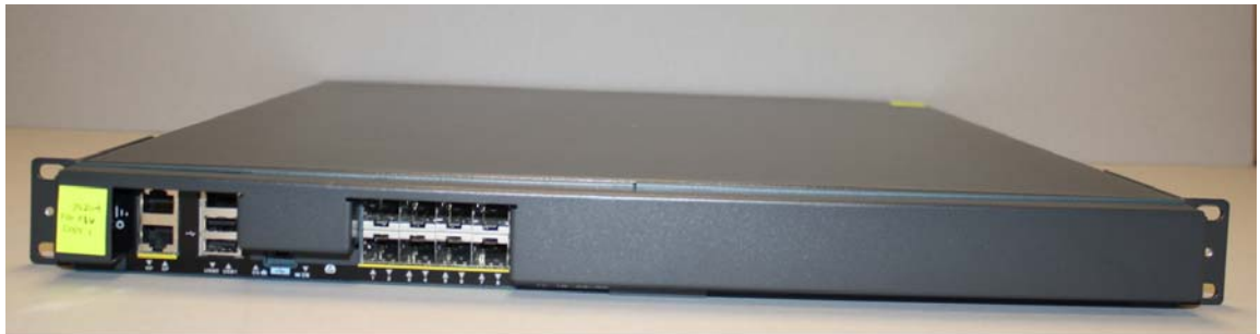
Figure 1 Entire Module

The module automatically detects, authorizes and configures access points, setting them up to comply with the centralized security policies of the wireless LAN. In a wireless network operating in this mode, WPA2 protects all wireless communications between the wireless client and other trusted networked devices on the wired network with AES-CCMP encryption. CAPWAP protects all control and bridging traffic between trusted network access points and the module with DTLS encryption.