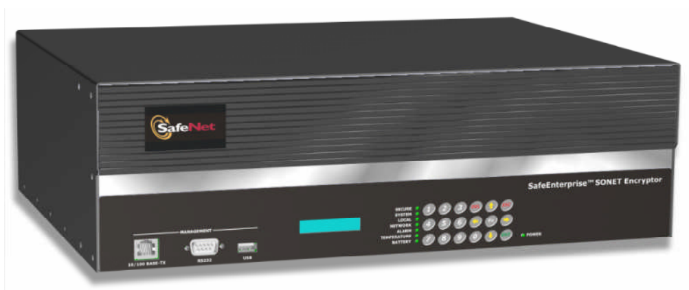
Figure 4. Model 650 Encryptor Front View.

The Model 650 encryptor has two network interfaces located in the back of the module: the Local Port interface connects to a physically secure private network and the Network Port interface connects to an unsecure public network. The rear view is identical for the models except for the labeling on the line interface card. The labeling identifies interface card as SONET or Ethernet.