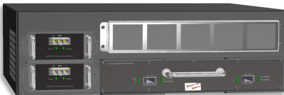
Figure 5. Model 650 Encryptor Rear View

The module has eight physical ports and four logical interfaces. The physical ports have the following functions: