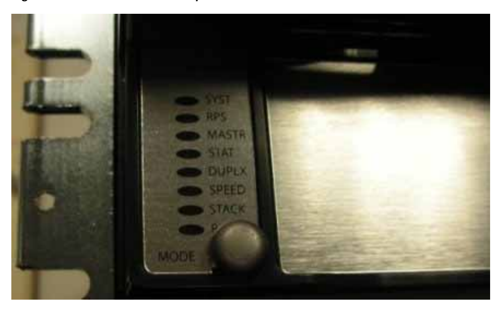
Figure 2 Placement of cap on the mode button

A cap must be placed on the mode button in order to prevent it from being pressed. Figure 2 shows the placement of the cap.