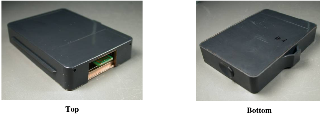
Figure 1 – Postal Security Device module (PSD)

The PSD (Figure 1) consists of a cryptographic sub function and postal services sub function sharing common hardware that is contained on a printed circuit board and enclosed within a hard, opaque, plastic enclosure encapsulating the epoxy potted module which is wrapped in a special tamper detection envelope with a response mechanism that causes the zeroization of plaintext CSPs. This enclosure constitutes the cryptographic physical boundary.