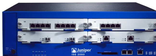
Fig. 2: NetScreen-ISG 2000