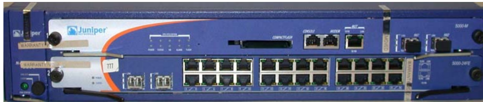
Fig. 4: Front of NetScreen-5200