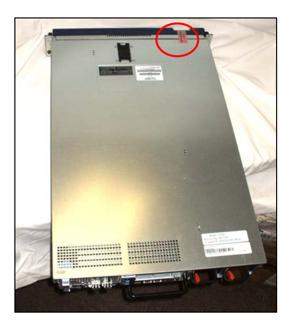
Figure 3 - Tamper-Evident Label Application Instruction at the Front

2. The cryptographic module's top panel can be slide back and be removed. A label needs to be placed across the right side center as shown in Figure 4. The label should be placed such that it is affixed to both the top cover and side of the chassis.