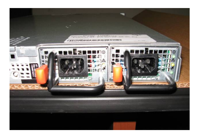
Figure 5 – Rear Panel of Secure Computing Secure Firewall (Sidewinder) 2150E

After the labels are placed as instructed above, the module can be powered up and the Crypto-Officer may proceed with initial configuration.