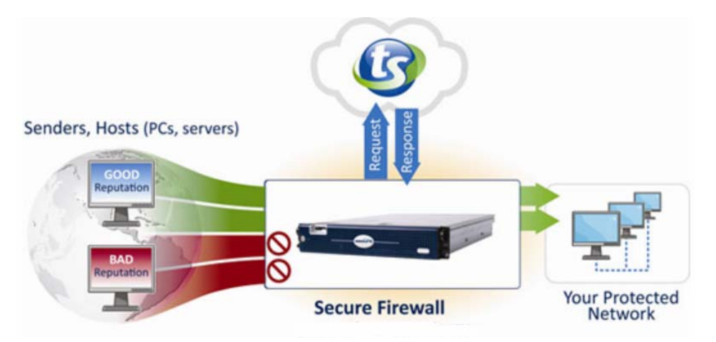
Figure 1 – Typical Deployment Scenario

Secure Computing® is a global leader in Enterprise Security solutions. The company's comprehensive portfolio of Secure Web, Secure Mail, Secure Firewall (Sidewinder), and Secure SafeWord solutions provide unmatched protection for the enterprise in the most mission-critical and sensitive environments. Secure Computing's Secure Firewall ( Sidewinder ) appliances are created to meet the specific needs of organizations of all types and enable those organizations to reduce costs and mitigate the evolving risks that threaten today's networks and applications. Consolidating all major perimeter security functions into one system, the Secure Firewall ( Sidewinder ) appliance is the strongest self-defending perimeter firewall in the world. Built with a comprehensive combination of high-speed application proxies, TrustedSource™ reputation-based global intelligence, and signature-based security services, Secure Firewall defends networks and Internet-facing applications from all types of malicious threats, both known and unknown.