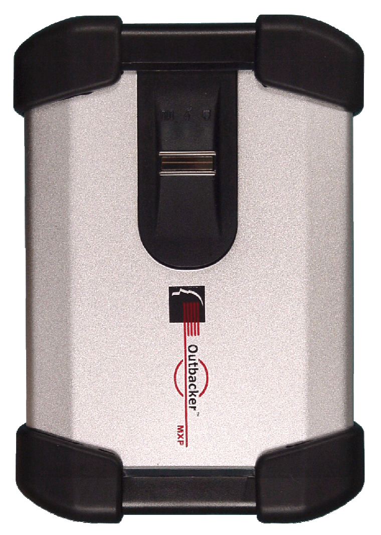
Figure 1: Photograph of Outbacker MXP